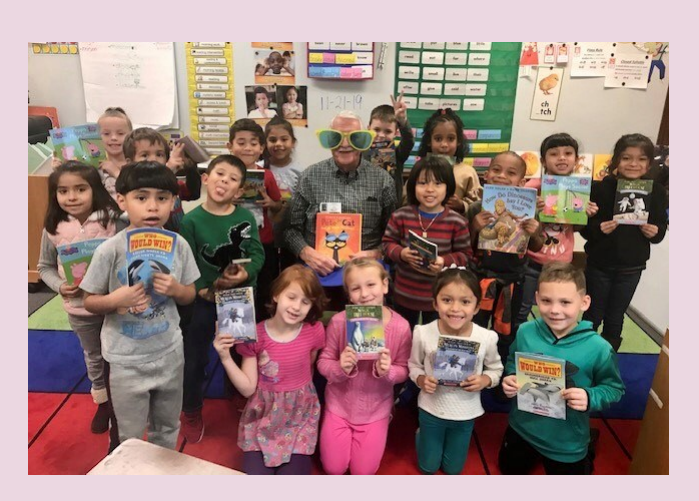
RIF (Reading is Fundamental)