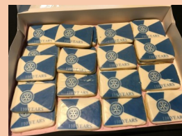
Happy 110th Anniversary, Rotary Club of Wichita!