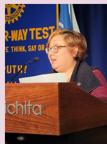
Fe Vorderlandwehr shares an inspirational moment.